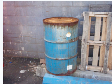
Improper storage: This 55-gallon drum is unlabeled, rusted, and not stored under cover.

Storm water can pick up pollutants that wash off or dissolve in water from materials that are exposed to rain or runoff flowing through the storage area.