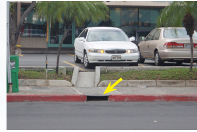
Sidewalk culverts are storm drain connections.

All drainage connections from properties to a City drainage facility must have a storm drain connection license issued to the property owner. Examples of drainage connections include pipes or hoses that convey flow directly into a gutter, channel, or drainage