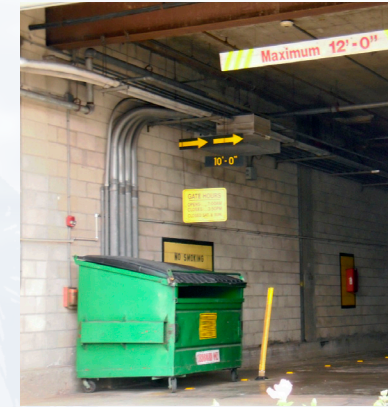
Storing dumpsters in covered areas minimizes storm water contact with trash.