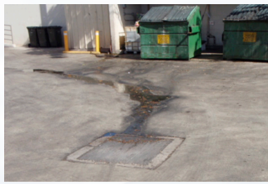
Pollutants (wash water and cleaner) flowing into a drain inlet contaminate the drainage system.

soil/sediment. For more information about pollutants and how they impact our environment, visit www.stormwaterhonolulu.com .