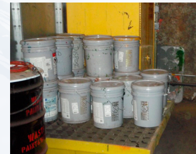
Containment pallets prevent leaks from entering the drainage system.