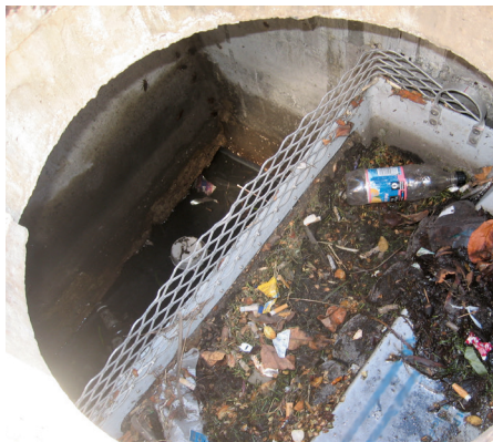
Catch Basin Inserts