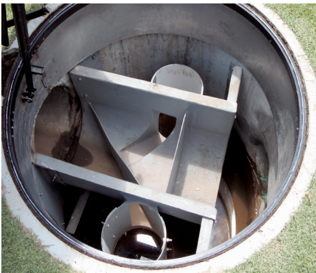
Manufactured Treatment Devices

A list of Post-Construction BMP service providers is available at Honolulu.gov/rep/site/dfmswq/ Post-ConstBMP_OMflyer_rev1. pdf .