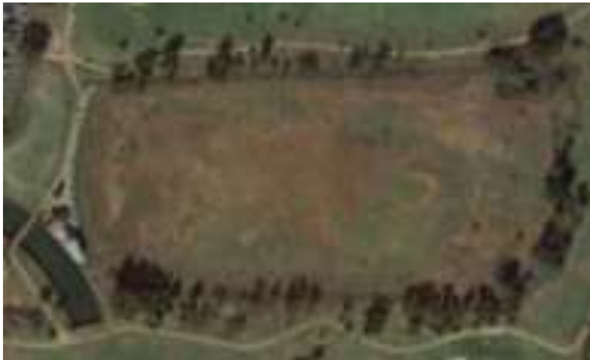
Imagery: 2016 Google Maps. Conditions prior to driving range improvement project.

The City and County of Honolulu's improvements to the Ala Wai Golf Course Driving Range included the installation of post construction treatment control BMPs to improve the water quality of the Ala Wai Canal. The treatment controls consists of constructing new detention basins at the northern and southern ends of the driving range. The driving range was re-graded to direct storm water towards these detention basins and re-vegetated to reduce soil erosion. These basins will be used to retain and infiltrate the first inch of storm water thus, allowing sediment and other pollutants to settle out of suspension and be retained on site. Larger storm events will overflow into drain inlets.