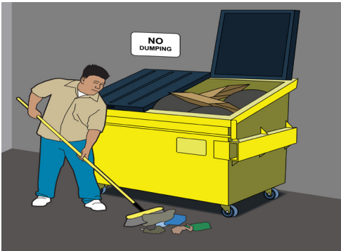
If the area requires cleaning, use dry clean-up methods such as sweeping or wiping with a towel.