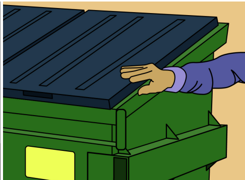
Keep dumpsters under shelter and/or lids closed to avoid exposing trash to rainfall.