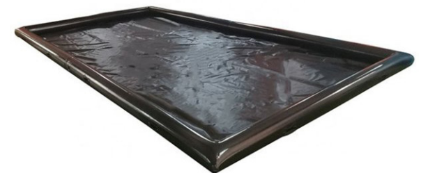
Water containment mats with berms are effective catchment systems for vehicle wash water. Several options are available for purchase online.