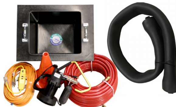
Basic car wash kit materials include hoses, pumps and barriers.