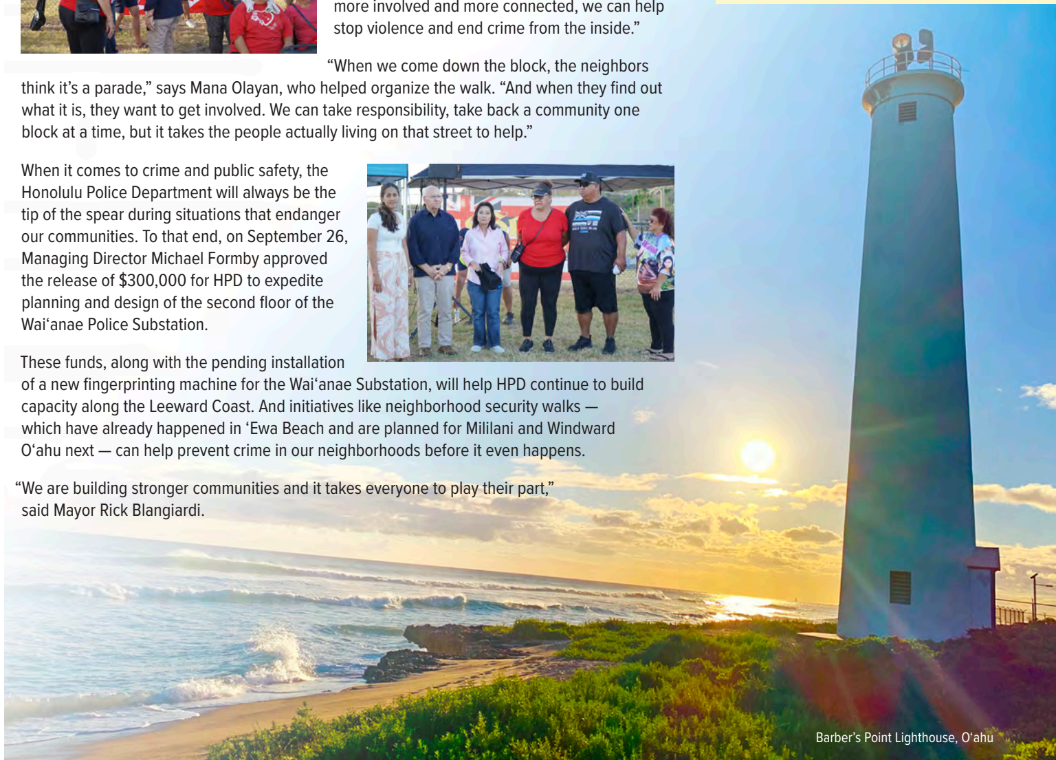
Barber's Point Lighthouse, O'ahu