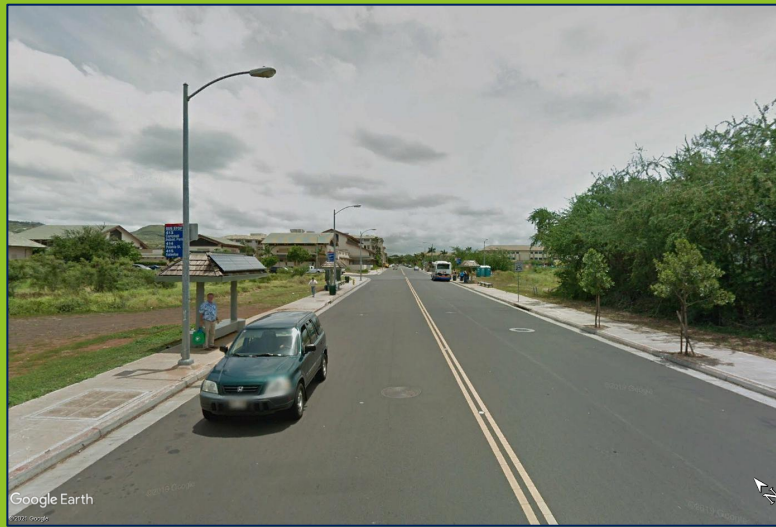
Current Transit Center