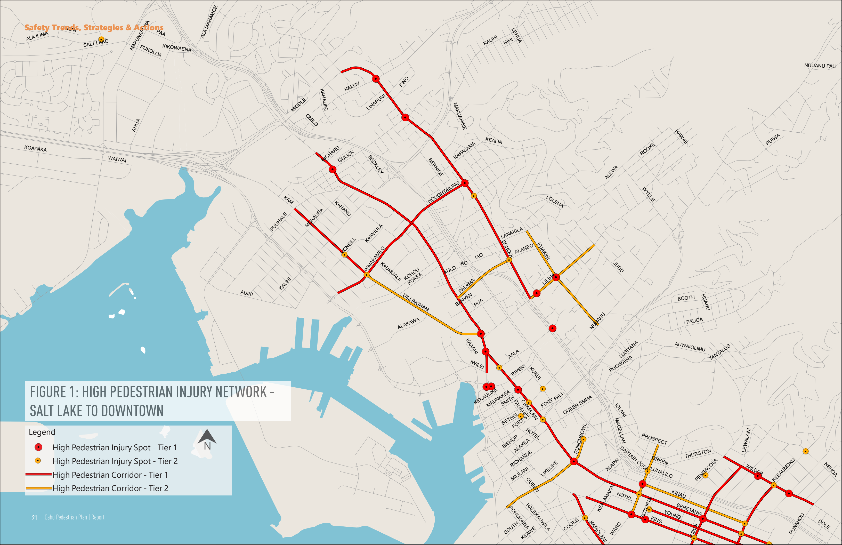
FIGURE 1: HIGH PEDESTRIAN INJURY NETWORK - SALT LAKE TO DOWNTOWN