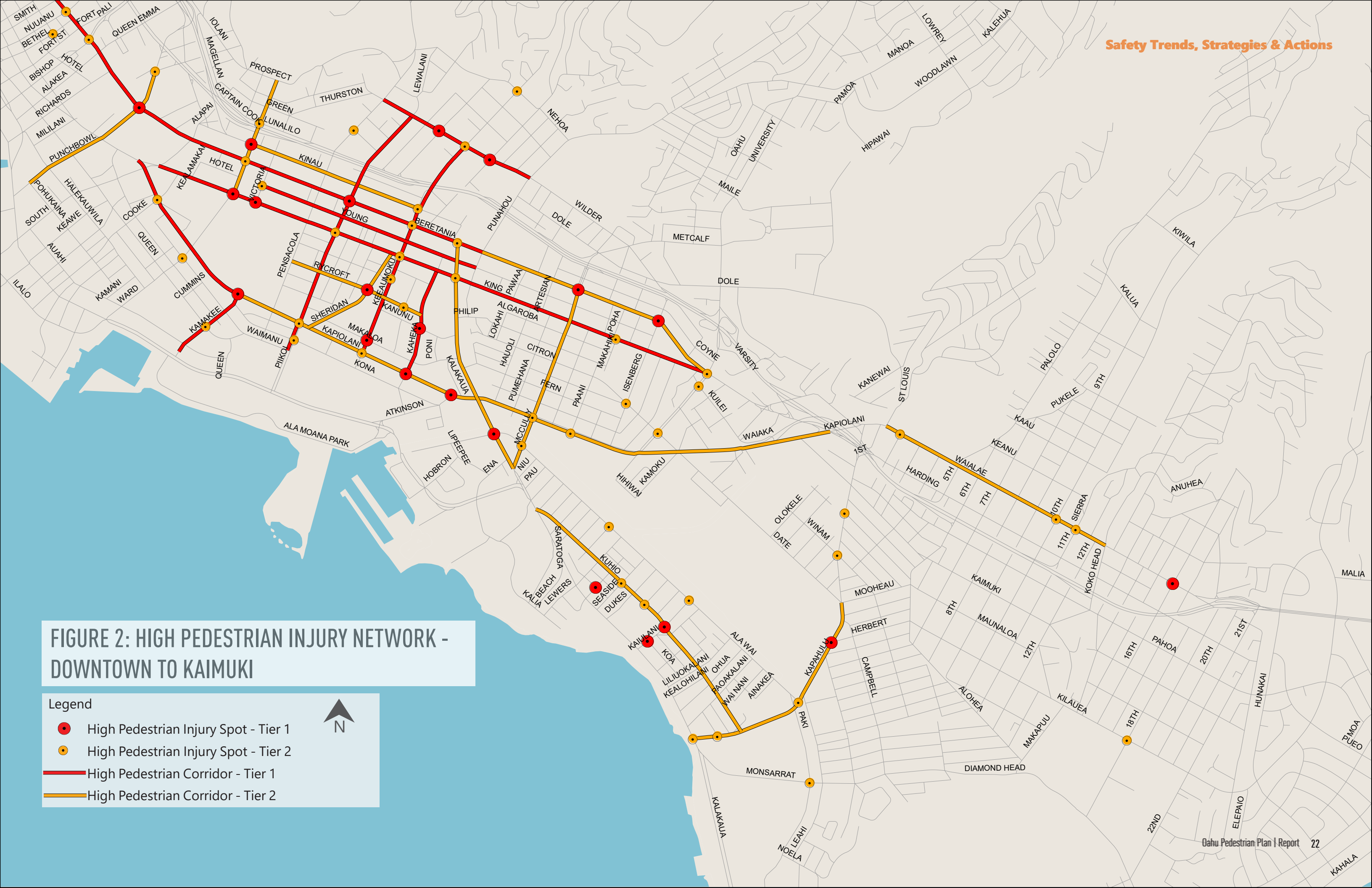
FIGURE 2: HIGH PEDESTRIAN INJURY NETWORK - DOWNTOWN TO KAIMUKI